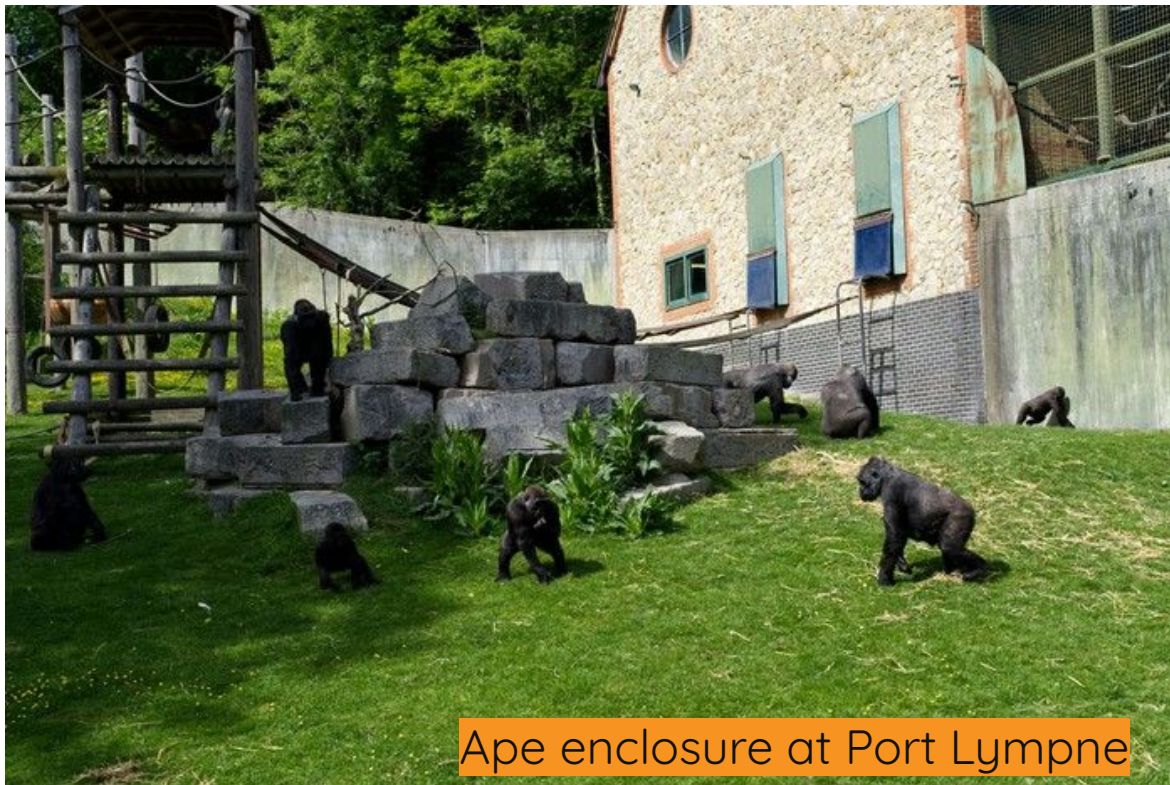
Ape enclosure at Port Lympne

How does this enclosure meet the needs of the great apes?