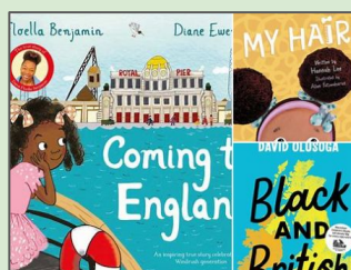
Coming to England