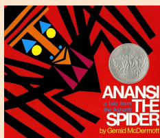
Stories from the past: Anansi the Spider