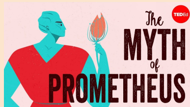
Greek Myth Tales: Prometheus